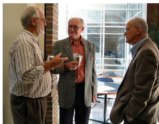
Relaxing between talks.