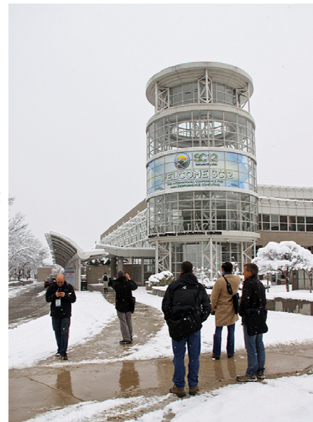
Snow outside the conference center in Salt Lake City, Utah.