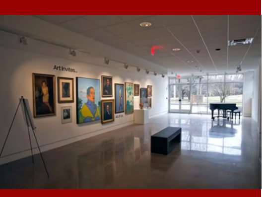
The Springfield Museum of Art is a neighbor to Wittenberg's campus, located at 107 Cliff Park Rd.

The Springfield Museum of Art is a hidden gem in the Springfield community that seeks to make art accessible to all people. Having just completed the renovation of their North Wing, they have classroom and meeting space that will help serve that goal. If you haven't been to the art museum recently, then you should check out their galleries with a vast range of art to appreciate.