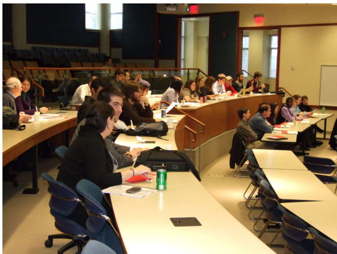
Attendees at MCURCSM '10 prepare for the next talk